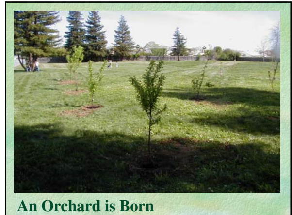
An Orchard is Born