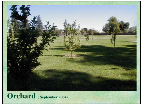
Orchard (September 2004)

The Residents adopted the Orchard and made sure it was watered.